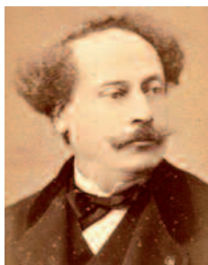
Alexandre Dumas fils