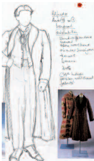
Alfredo costume design