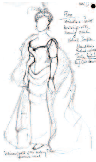
Flora costume design