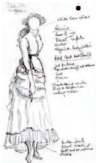
Annina costume design