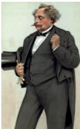
Alexandre Dumas fils