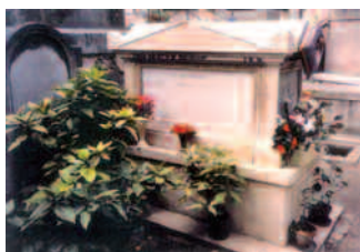
The Tomb of Marie Duplessis

The beautiful Lady Mary! How could she die? – and of consumption! But it is a path I have prayed to follow. I would wish all I love to perish of that gentle disease. How glorious! to depart in the hey-day of the young blood – the heart all passion – the imagination all fire – amid the remembrances of happier days – in the fall of the year – and so be buried up forever in the gorgeous autumnal leaves! Edgar Allan Poe, Metzengerstein