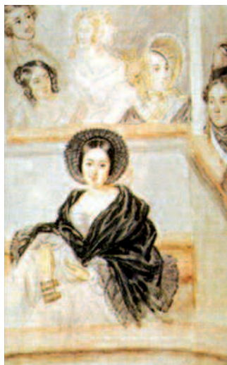
Marie Duplessis at the theatre

daunted by the high-lying vocal line. (The part was later revised, along with several other sections, before the second production at the Teatro San Benedetto a year later.)