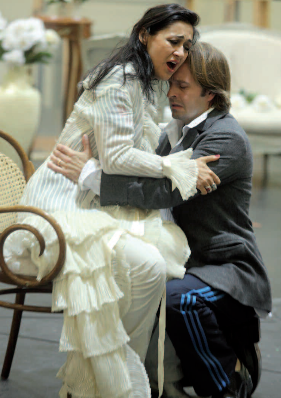
Myrtò Papatanasiu and Alfie Boe in rehearsal