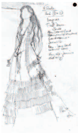
Violetta costume design

Mae Violetta Valéry, sydd eisoes yn sâl, yn syrthio mewn cariad ag Alfredo Germont. Ond mae ei dad yn gwrthwynebu'r berthynas oherwydd y bydd yn peryglu gobeithion ei ferch ei hun o briodi'n dda. Mae Violetta yn cytuno i adael Alfredo, ond mae e'n ei dilyn i Baris ac yn ei diarddel. Mae salwch Violetta yn gwaethygu, ac mae hi yn cymodi ac Alfredo cyn marw.